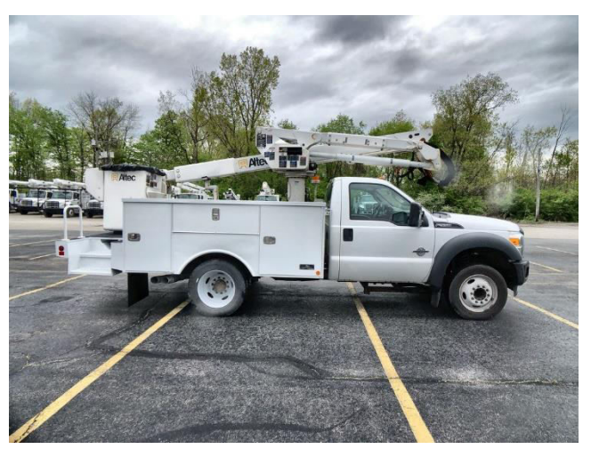
2014 ALTEC AT40G Stock #: 73332303 Chassis: 2014 Ford F550 Location: Ft Wayne, IN $64,900 Used 127,094 mi.