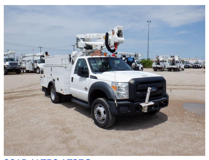
2015 ALTEC AT37G Stock #: 75164590 Chassis: 2015 Ford F550

2011 ALTEC AT40M Stock #: 72075612 Chassis: 2011 Ford F550 Location: Wentzville, MO $49,900 Used 177,771 mi.