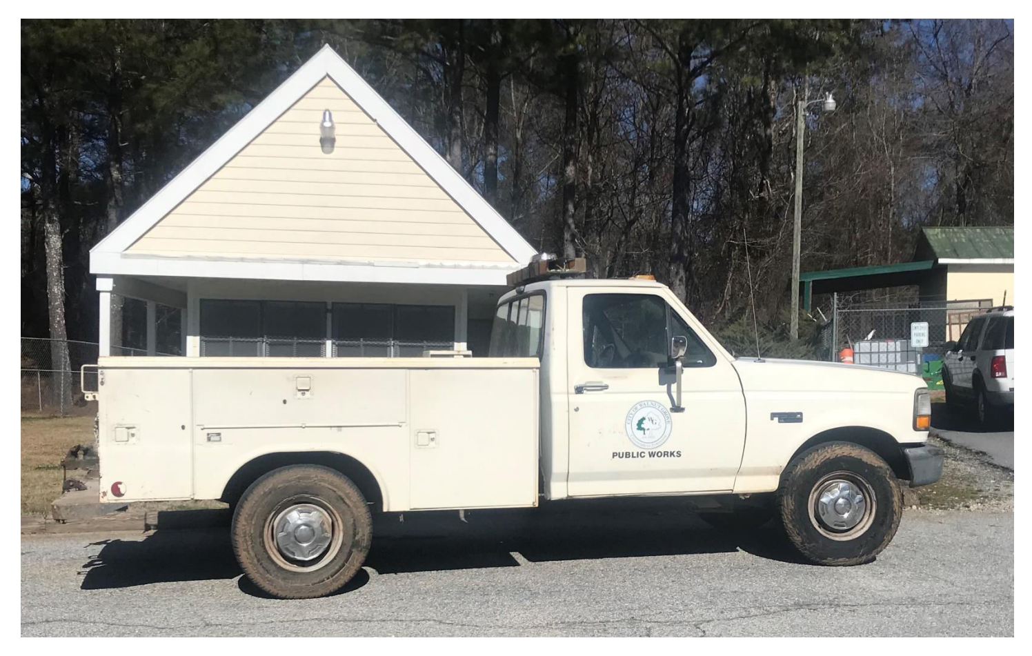
1993 Ford F-350 with 218,628 miles