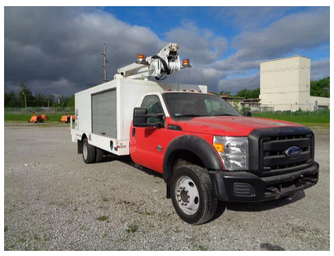
2013 ALTEC AT248F Stock #: 65197814 Chassis: 2013 Ford F550 Location: Ft Wayne, IN $64,900 used 102,130 mi.

2015 ALTEC AT37G Stock #: 74605564 Chassis: 2015 Ford F550 Location: Waxahachie, TX $74,900 Used 112,101 mi.