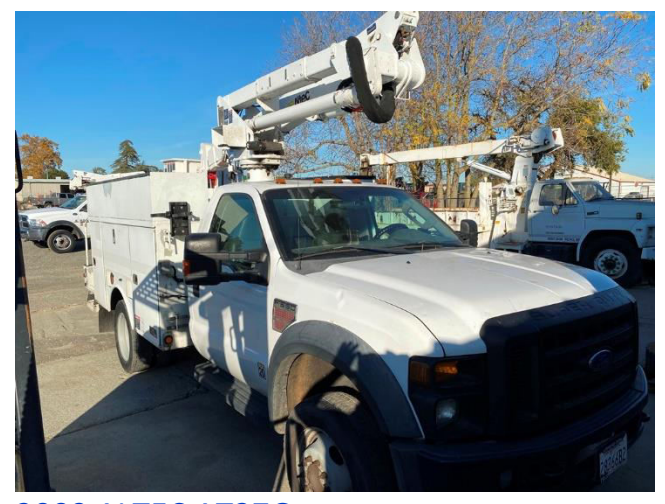
2009 ALTEC AT37G Stock #: 79175767 Chassis: 2009 Ford F550 Location: Dixon, CA $39,900 Used 149,259 mi.