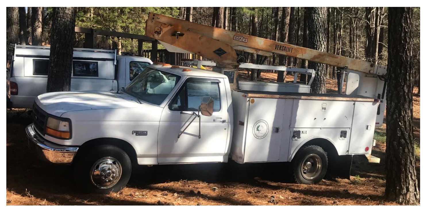
1994 F-350 Bucket Truck with 146,757 miles