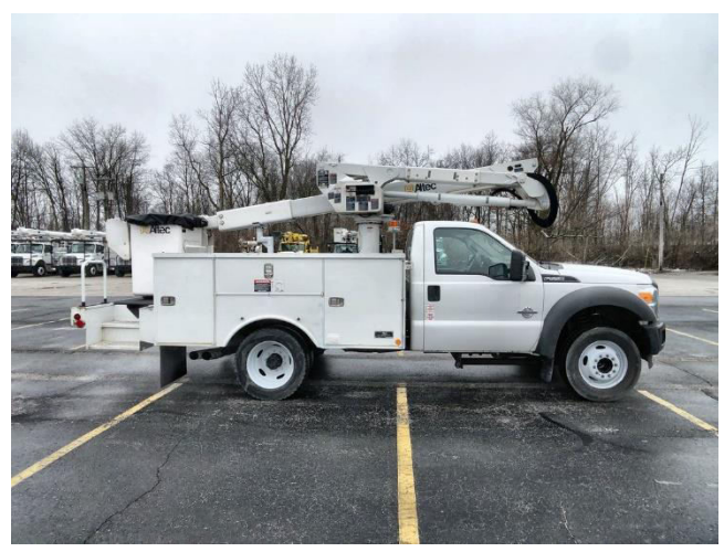
2014 ALTEC AT40G Stock #: 73332302 Chassis: 2014 Ford F550 Location: Ft Wayne, IN $64,900 Used 125,589 mi.

2013 ETI ETC37IH Stock #: 78696663 Chassis: 2013 Ford F550 Location: Randolph, MO $44,900 Used 187,879 mi.